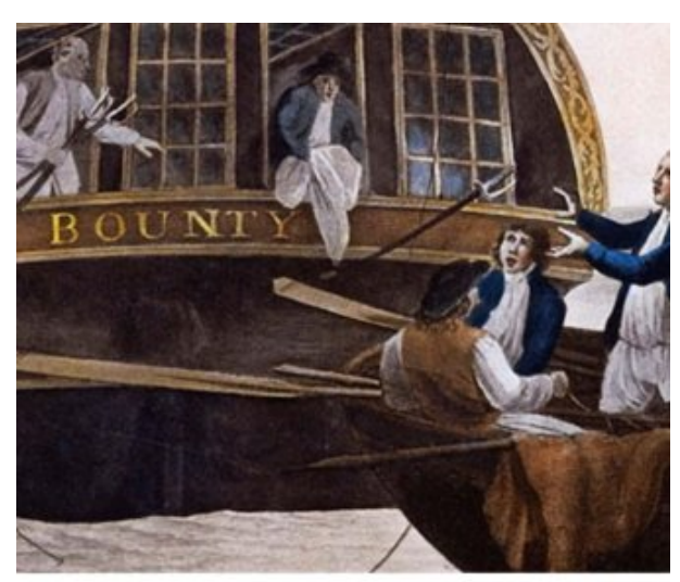
PITCAIRN'S ISLAND CHARLES NORDHOFF